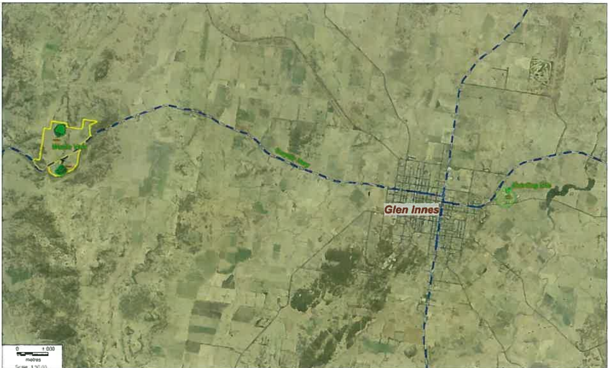
Fig.1 Site location