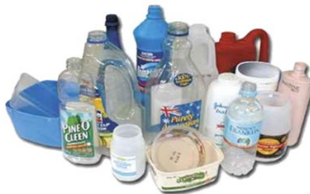
Plastic bottles (# 1-7)