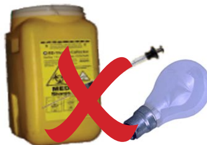
No medical & hazardous wastes