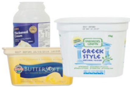
Plastic containers (# 1-7)