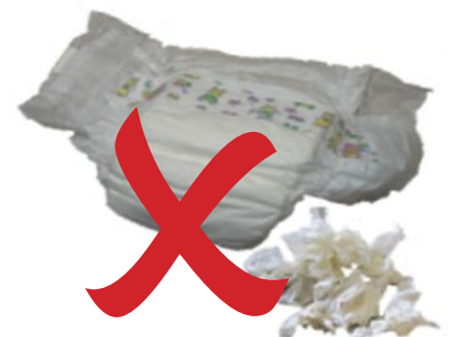
No nappies & tissues

For more information visit https://www.gisc.nsw.gov.au/