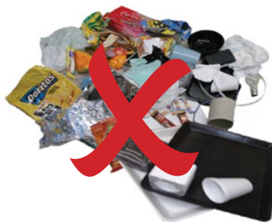
No wrappers & foam