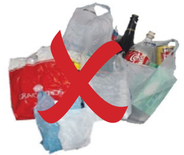
No plastic bags