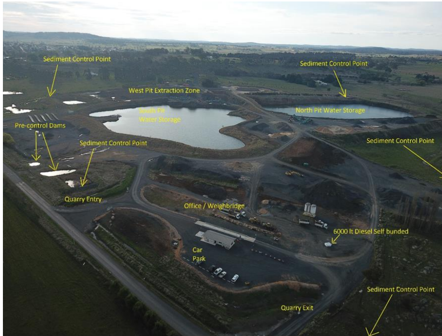
Image – Aerial view Glen Innes Aggregates