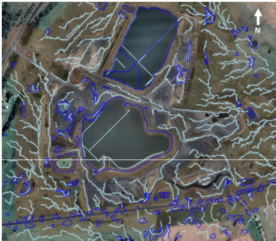
Figure 1 – Estimated Eater Flow during Rain Events – Glen Innes Aggregates

This stormwater runoff model is also available in Propeller on the “Design” tab under “Enviro” labelled as “Env_Water_Catchment_Analysis_200701”.