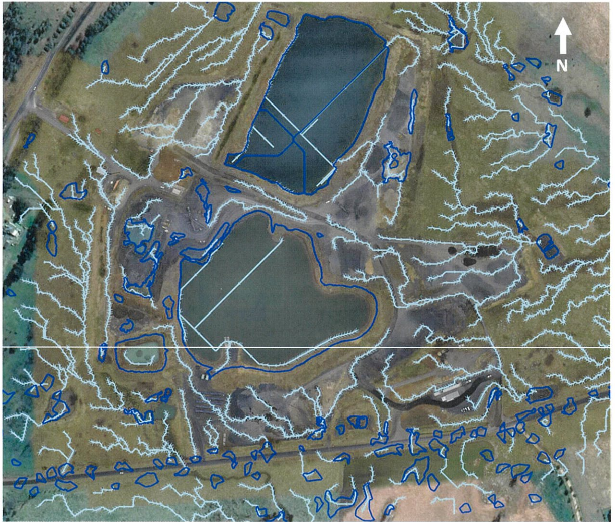
Figure 1: Current topography water runoff analysis (01 July 2022)